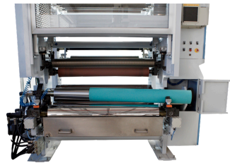
TRANSFER ROLLER WITH RUBBER SLEEVE